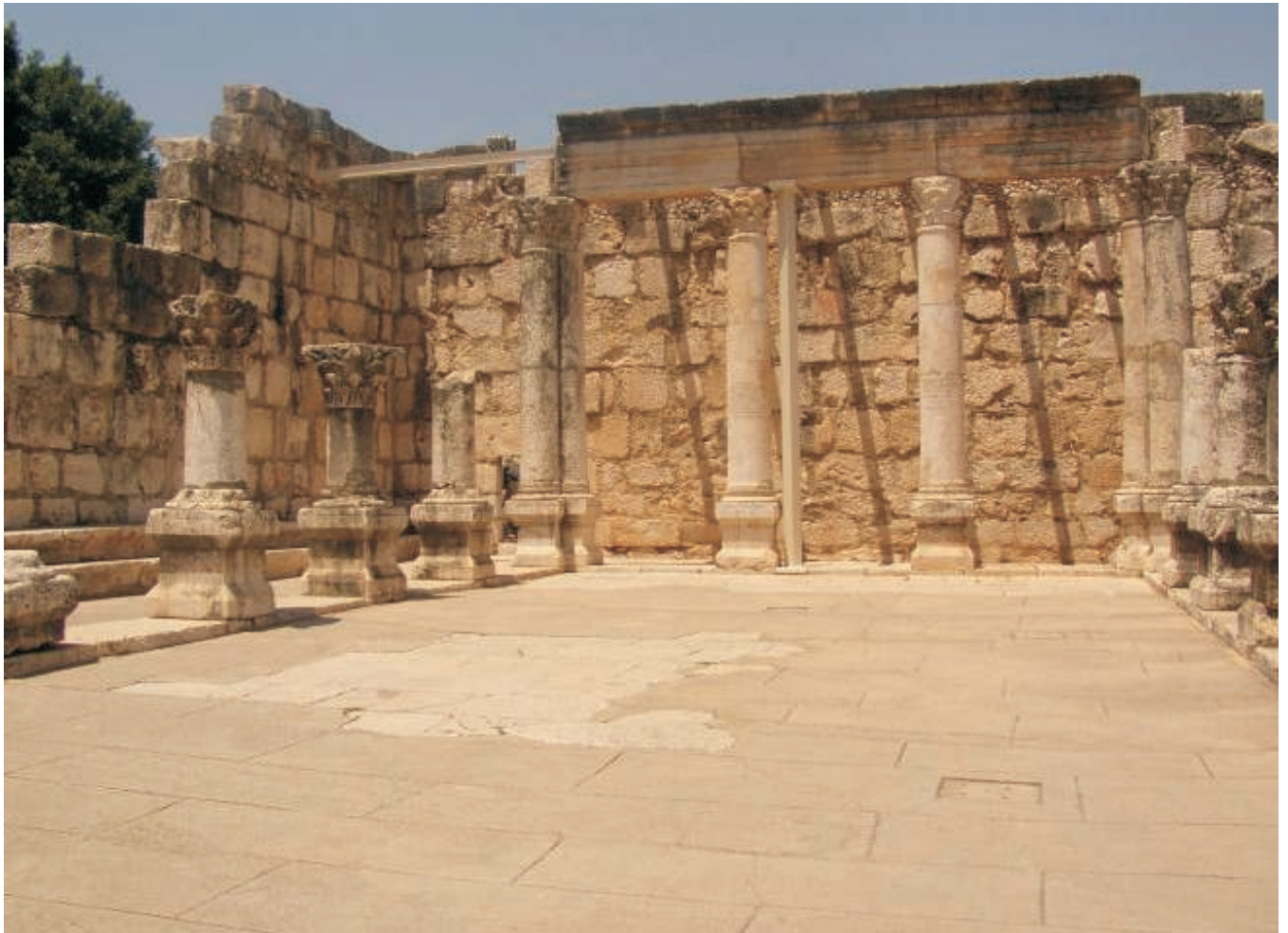
The Ruins of the 4th-Century Capernaum Synagogue

YEHOVAH God's TRUE Sabbath Day -- Part 2