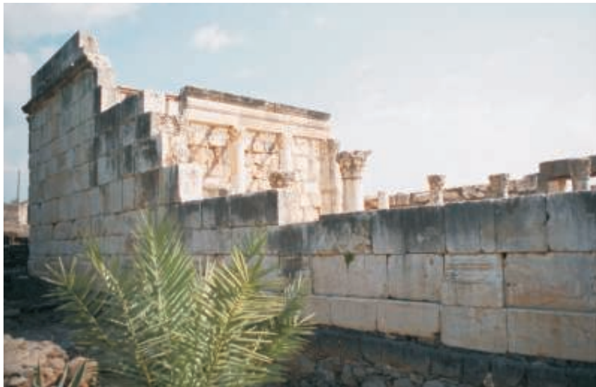
Another view of the synagogue in Capernaum.

YEHOVAH God created the Sabbath so that on it we may rest and have personal constructive CONTACT with the One who is creating us to be His spirit-born Sons. For YEHOVAH's very PRESENCE is among those who keep His true Sabbath -- those who SUBMIT to Him as their Creator and Ruler.