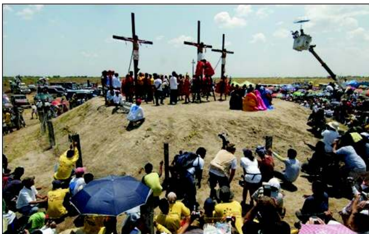
Ritual crucifixion in the Philippines. Penance of any kind is loathsome to YEHOVAH God!

8. What blessings will YEHOVAH bestow upon those who fast and seek Him in the RIGHT ATTITUDE? Verses 8-11. Isn't this kind of fasting WORTHWHILE and WELL-PLEASING to YEHOVAH God?