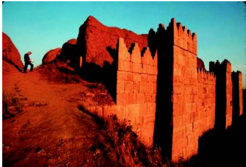
The site of ancient Nineveh. YEHOVAH God sent Jonah to warn this great Assyrian metropolis of its impending doom.

YEHOVAH's warning? Jonah 3:5. Was a FAST proclaimed for ALL the population? Same verse.