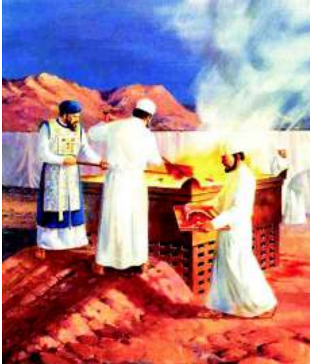
Priests in white robes assisting at the altar.

COMMENT: Here sins that have been washed away and made CLEAN are likened to the WHITENESS of snow.