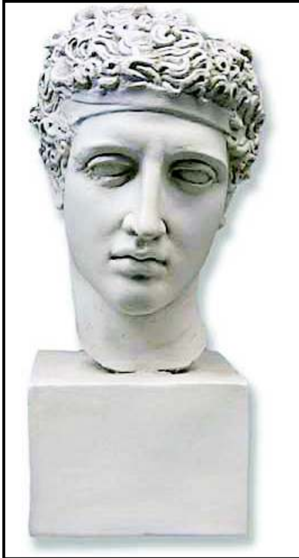
Bust of Greek athlete wearing the victor's crown or stepha.nos .

joining is to be in the presence of the Messiah at his coming.