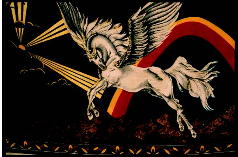
The winged horse Pegasus. Some claim this mythic horse is the white horse of Revelation 6!

"...in Genesis 1:14, the scripture talks about the stars and says, 'let them be for signs'. Thus we look to the stars for the horse who will bring forth the sign, or direction of God, of the