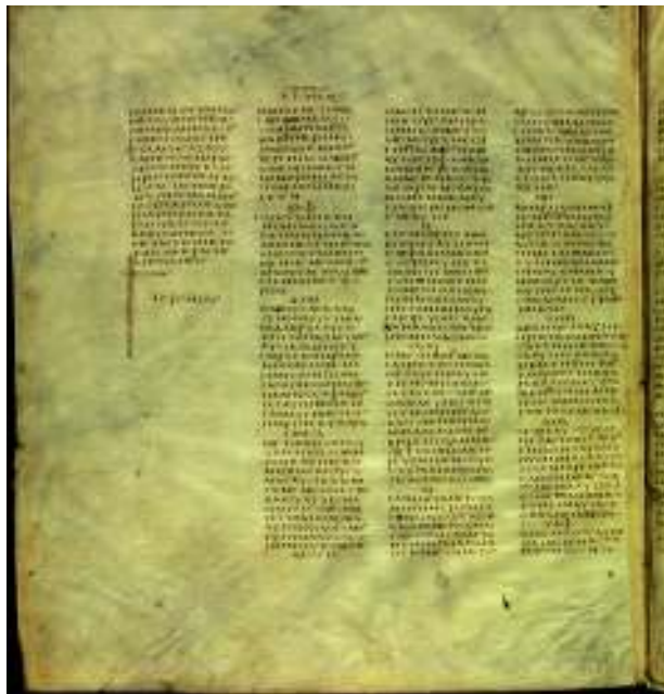
Photographic reproductions of the Codex Sinaiticus (above) and the Codex Alexandrinus (right). These manuscripts, written in Greek, have been corrupted by Greek scribes.

8. As late as Paul's SECOND imprisonment in Rome, was there still a congregation there? Colossians 4:10-12, 14, Philippians 4:21-22 .