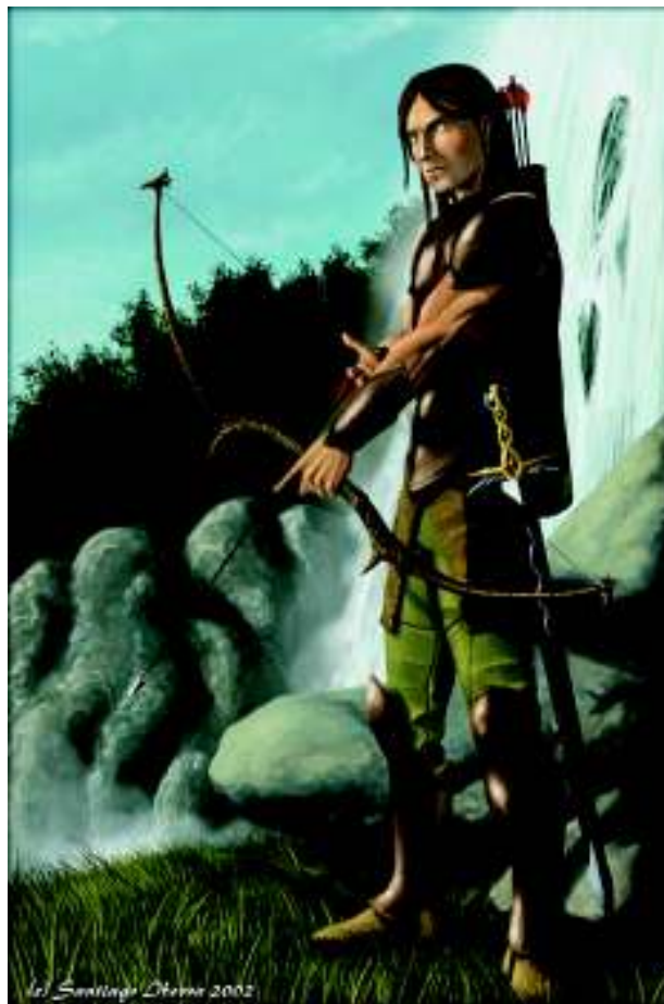
Stylized picture of an archer with bow.

COMMENT: These verses show that the BOW is a SYMBOL of that which discharges the messages of YEHOUAH God toward an intended target. In other words, it symbolizes THE PREACHING OF THE TRUE