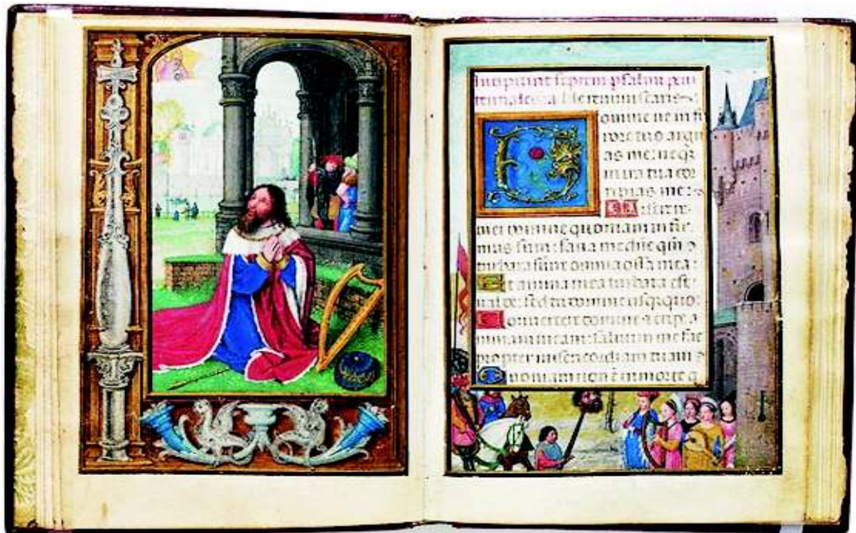
The Power of Prayer!