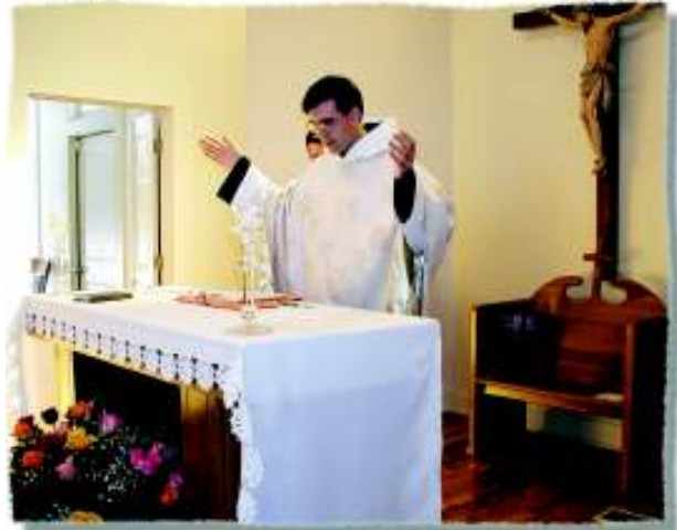
Catholic priest in ritualistic prayer that is abhorrent to YEHOVAH God.

The glory of YEHOVAH's Kingdom can be attained only with YEHOVAH's personal