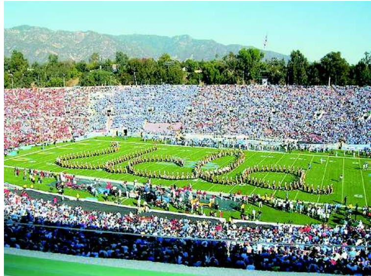
Crowd viewing half-time show at a football game in the Rose Bowl, Pasadena, California. A great deal of human nature is expressed at such events.

When YEHOVAH God created MAN, He formed man of the DUST OF THE