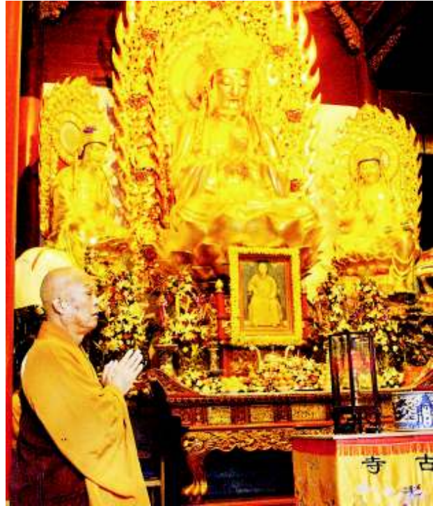
Buddhist monk praying to a dead pagan god that cannot answer prayer!

1. Did the apostle John admit that all of us -- including Christians -- still commit sins and come short of YEHOVAH's glory? I John 1:8 and Ecclesiastes 7:20 compared with Romans 3:23 . If we say that we do not sin, are we DECEIVING ourselves? Same verses . Then isn't it plain we, of ourselves, cannot overcome our evil nature and achieve membership in