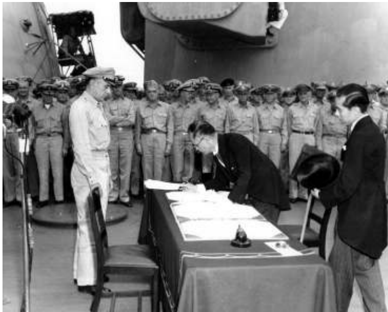
Japanese delegation signs World War II unconditional surrender documents aboard the USS Missouri, September 2, 1945. Mankind is at war with YEHOVAH God and must surrender unconditionally to Him!

War to the DEATH -- and I mean ETERNAL DEATH, or else to ETERNAL LIFE. And you must choose which. You cannot have both.